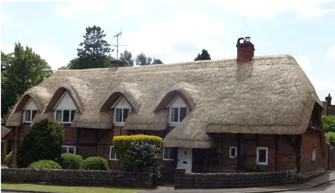
Thatch-roofed house in Chawton, England.